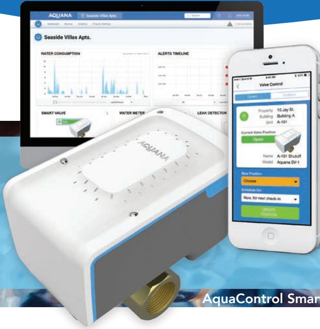
AquaControl Smart Water IoT Platform